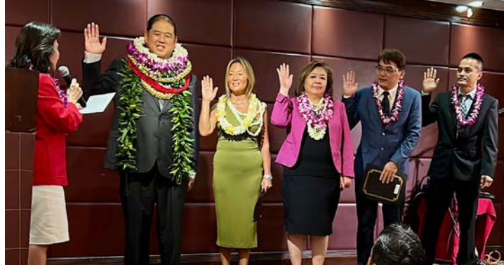
Chamber Installation