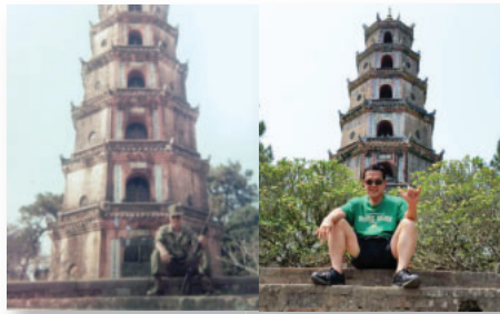
Hue, Vietnam April 1969