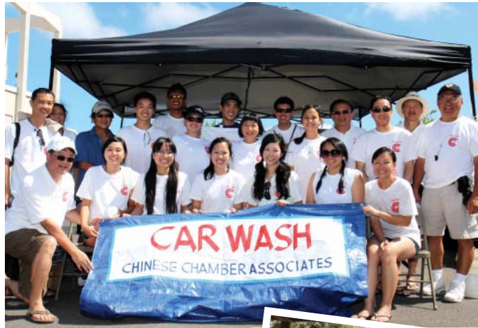
Associates' Car Wash on April 28