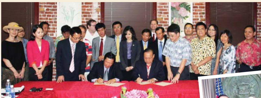
Above: The actual signing agreement between CCPIT Hainan Subcouncil and Chinese Chamber of Commerce of Hawaii on Nov. 14, 2011,