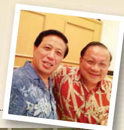
Dinner reception with Chinese communities hosted by Ambassador of PRC at Washington Zhang Yesui