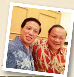
Dinner reception with Chinese communities hosted by Ambassador of PRC at Washington Zhang Yesui