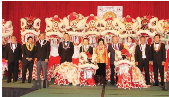
Chinese Chamber of Commerce of Hawaii Centennial Banquet Celebration on Nov 26, 2011 at Hilton Hawaiian Village Coral Ballroom