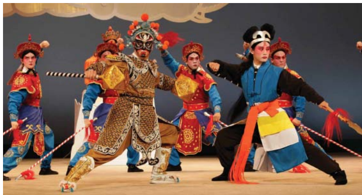
Chinese Jingju (Beijing Opera) production of "The White Snake" at UHM's Kennedy Theatre Feb. 5-14.