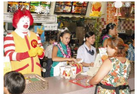
54th Narcissus Queen and Court and 55th Narcissus Queen Contestants took part in the community service activity "McDonald's World Children Day Fundraiser" on November 22, 2003, at the McDonald in the Ala Moana Shopping Center.