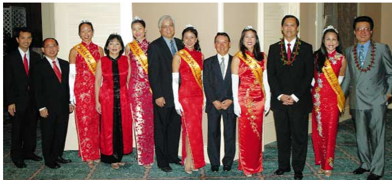
More than 400 people attended the 55th Narcissus Festival Kick-off Reception, held on November 13, 2003 at the Hilton Hawaiian Village Coral Ballroom.