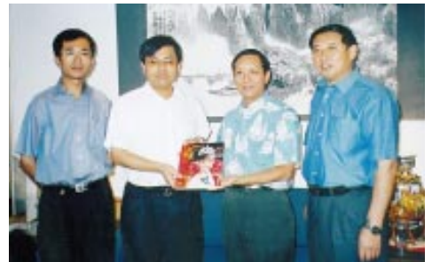
A delegation of 4 from Penglai City, Shangdong Province, China, led by Mayor Song Junji, visits Chamber's office on August 12, 2002.