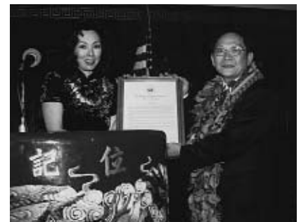
Chinese Chamber Installation Banquet is held on May 28, 2000 at Waikiki Lau Yee Chai.