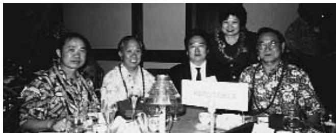
Right & Below: Guangdong Delegation Aloha Banquet—May 30, 2000 at Hilton Hawaiian Village Rainbow Suite.