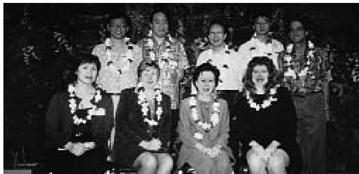
A group picture of Chamber's new members, who are invited to attend the General Membership Meeting and Trade Show, is taken at the event held at Pagoda Hotel, Thursday, April 6, 2000.