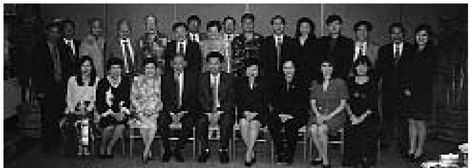
Zhaoqing delegation members are delighted to meet the representatives of the DBEDT and the CCCH at welcome dinner.